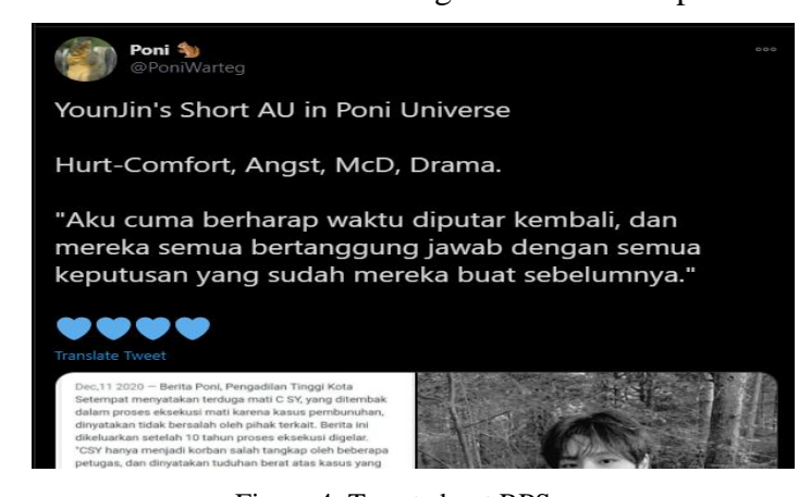
Figure 4. Tweet about RPS

RPS stands for Real Person Slash . It's a fan fiction term, it means the characters are based on real people and they are paired with the same sex. Slash is a subgenre of fan fiction involving male/male pairings. The word derives from the classic Star Trek fandom; early fans who shipped Kirk and Spock stylized, which contributed to the entire genre being named slash. And there are some of K-pop fan that made a fan fiction with this genre like in this picture below.