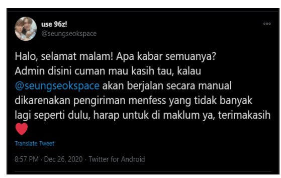
Figure 1. Tweet about menfess

Menfess is a term combination of two phrases mention and confess . Essentially, it involves mentioning someone (on social media), confessing something to them and doing it all anonymously. It is not always a confession, it can be a message or even a question. If there is a Twitter user provides "auto-menfess", this user is called fan base. They provide some kind of service to anonymously post or tweet the users menfess, for example, this picture below is a base that provides an auto mention confess.