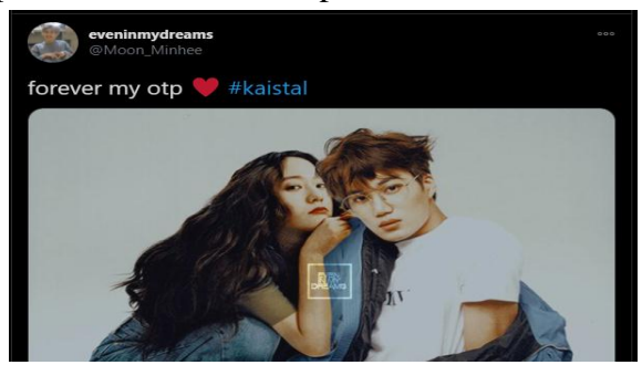
Figure 3. Tweet about OTP

OTP is short of One True Pairing . It signifies a person's favorite fictional romantic relationship. Fans ship their favorite idol because of their perfect chemistry and fans are, really ship. For example, this user below ships Korean idol Kai and Krystal.