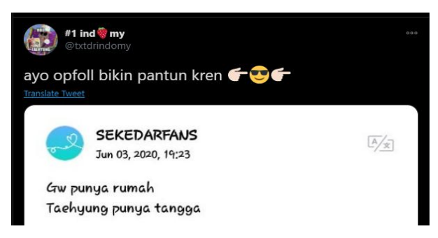
Figure 2. Tweet about Opfoll

Opfoll is Open Follow back . Usually, fan base, big or famous account followed by many users, it does the open follow back so they become a mutual or following each other. Sometimes, open follow back has few terms and rules such as promote or share their account. For example, this picture below shows a fan base asked their followers to create pantun , so they will get a follow back.