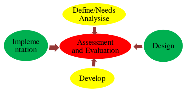
Figure 1. Logarithmic module research flow

This study uses a Research and Development (R&D) approach to define, design, develop, implement, and evaluate strategies (Mavrotas & Makryvelios, 2021). The product developed in this research is a math module for logarithms. This module is a tool for learning logarithmic material in class and can be used by students at home (Mishra et al., 2020). The following is the development research flow used.