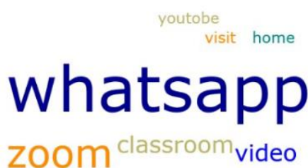
Figure 1. Word cloud learning media

Learning media is the main thing in the implementation of online learning. Learning media connects teachers and students to interact and communicate teaching and learning. In this industrial era 4.0, many learning media platforms can help the learning process. Based on the analysis results with Atlas.ti , the learning media used by teachers are as shown in Figure 1.