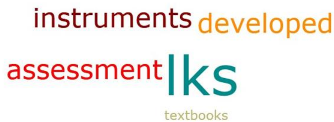
Figure 4. Assessment instruments

the teaching and learning activities better than before (Mansyur et al., 2019). The assessment process includes collecting evidence about student learning achievements, tests, observations, or self-reports (Mardapi, 2008). The assessment model in inclusive schools is adjusted to the type of curriculum used by each academic unit. According to the Directorate of PPK-LK (2011), the assessment model in inclusion schools includes using the national standard curriculum, and the assessment can be done without modification or modification according to the type of student's feasibility. While if using an accommodative curriculum, the assessment is adjusted to the type and level of student ability. So, whether using the national standard curriculum or accommodating, teachers can modify the assessment according to students' ability level with special needs in their schools. The assessment instruments used by teachers can be seen in Figure 4.