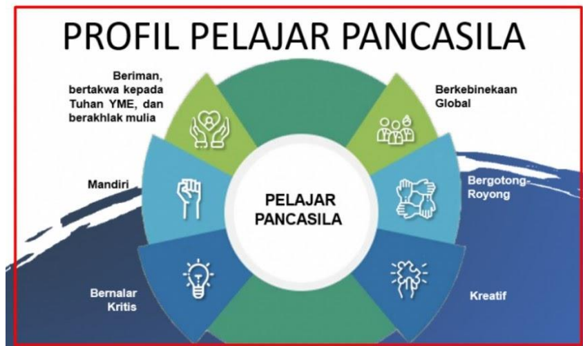
Figure 2 Profile of Pancasila Students

The implementation of Pancasila as the basis for the development and implementation of the Merdeka Belajar Kurikulum emphasizes the Pancasila Student Profile in accordance with the Vision and Mission of the Ministry of Education and Culture as stated in the Minister of Education and Culture Regulation Number 22 of 2020 concerning the Strategic Plan of the Ministry of Education and Culture for 2020-2024. Pancasila students are the embodiment of Indonesian students as lifelong learners who have global competence and behave in accordance with Pancasila values, with six main characteristics: faith, devotion to God Almighty, and noble character, global diversity, mutual cooperation, independence, critical reasoning, and creative as in the picture below.