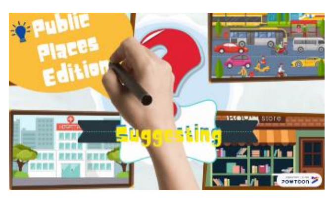
Figure 3. The Prototype for Public Places Topic