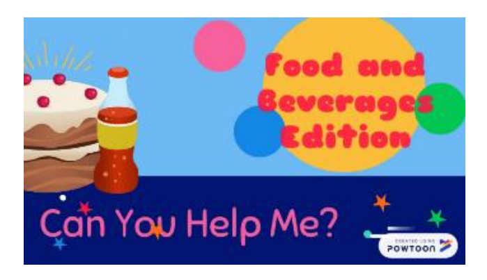
Figure 2. The Prototype for Food and Beverages Topic