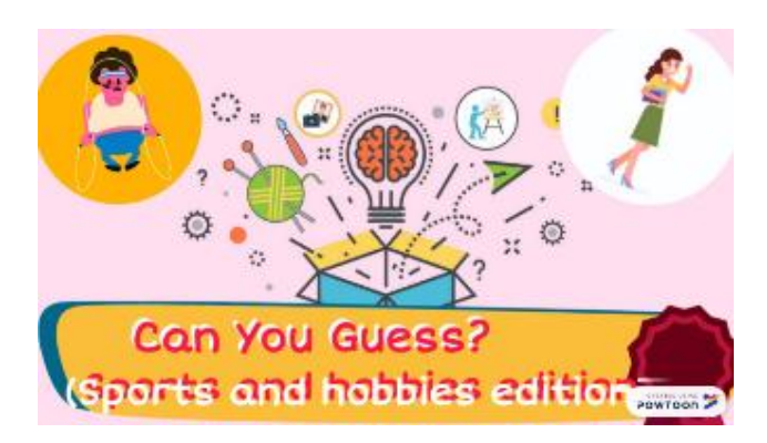
Figure 4. The Prototype for Sports and Hobbies Topic